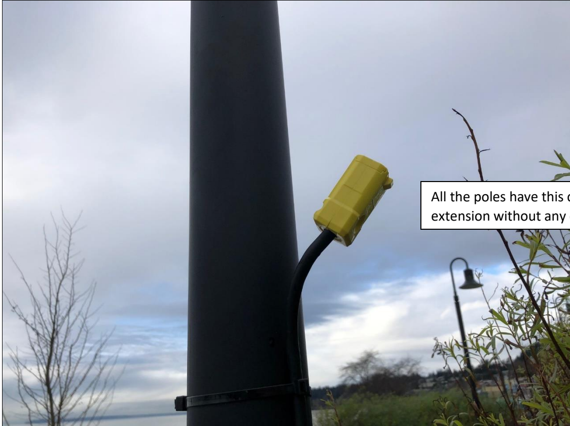
All the poles have this cord extension without any cover