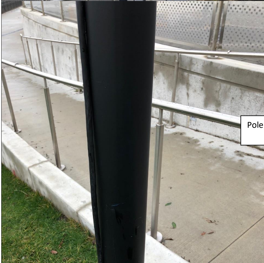
Pole #8: Scratches on the pole