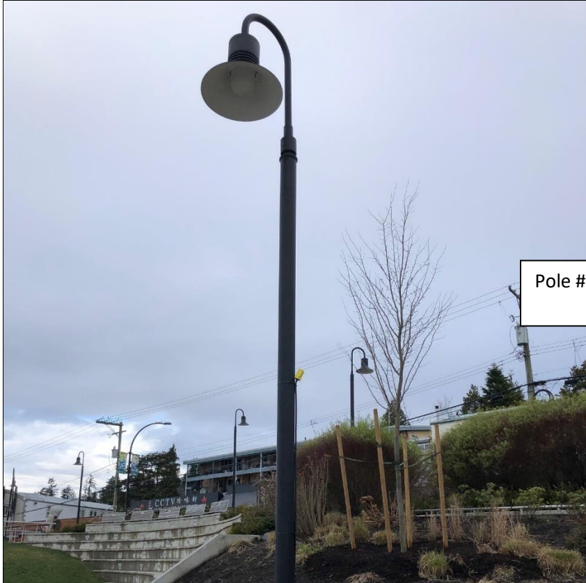
Pole #9: Scratches on the pole