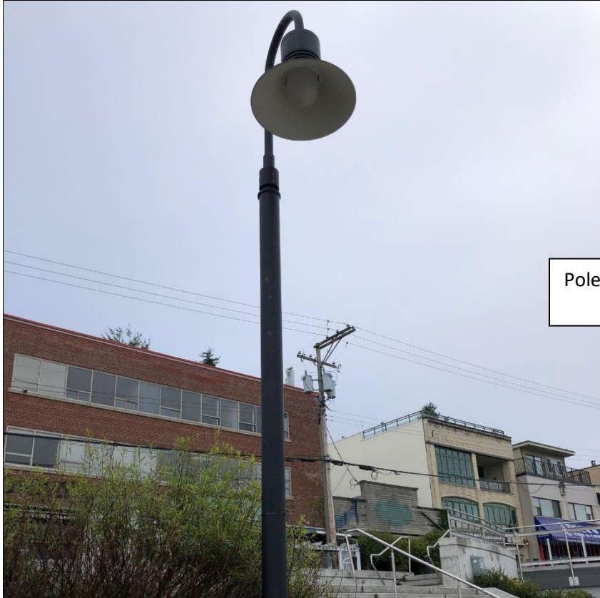
Pole #6: No damage on the pole