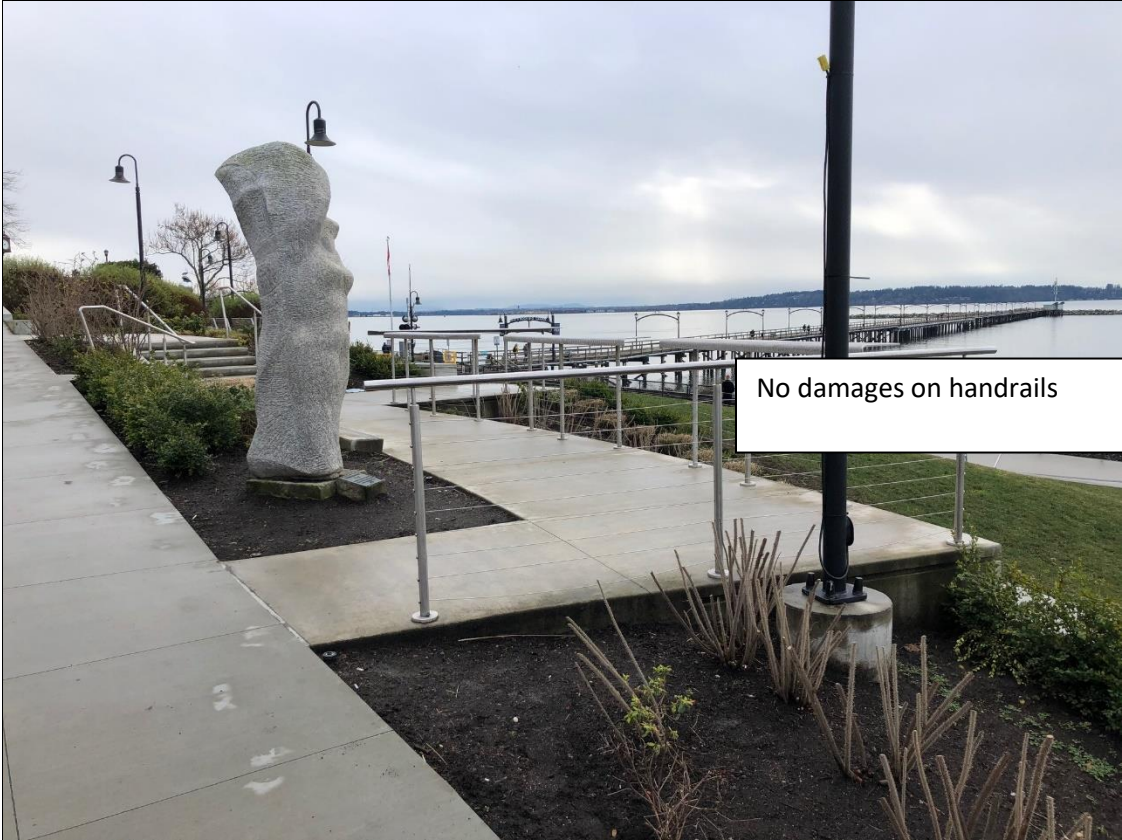
No damages on handrails