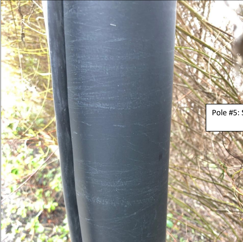
Pole #5: Scratches on the pole