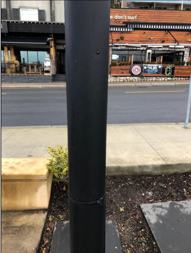
Pole #1: Scratches on the pole