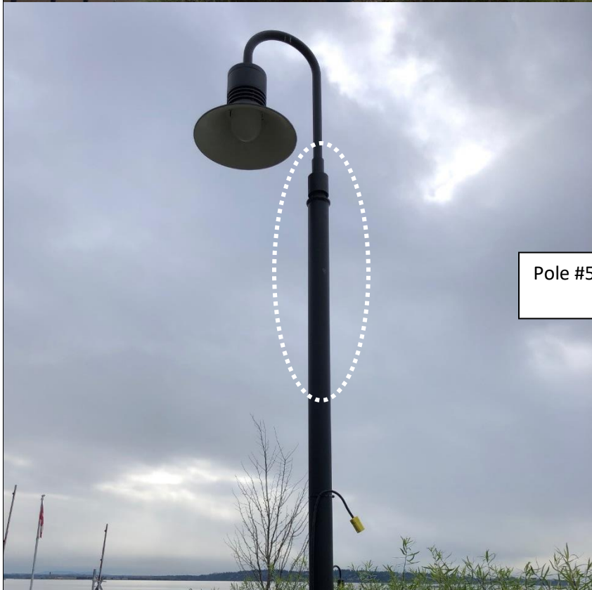
Pole #5: Taping left on the pole