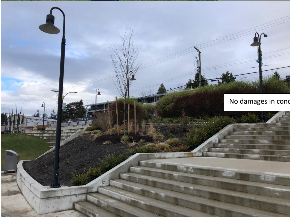
No damages in concrete