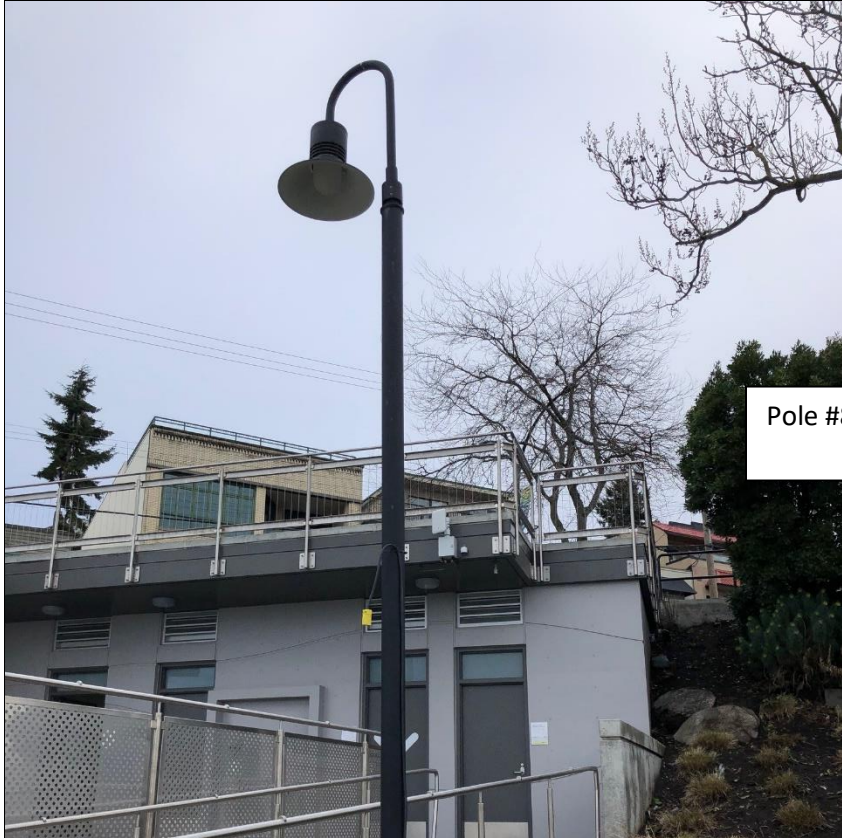
Pole #8: No damages on the pole