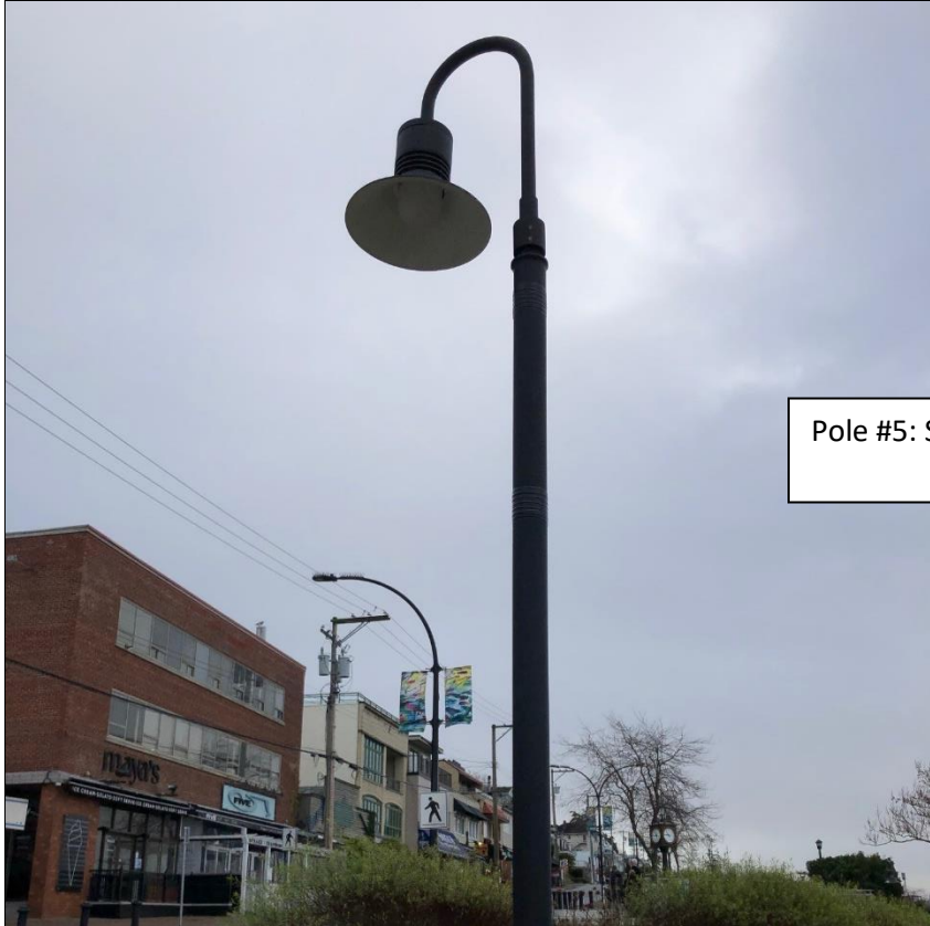
Pole #5: Scratches on the pole