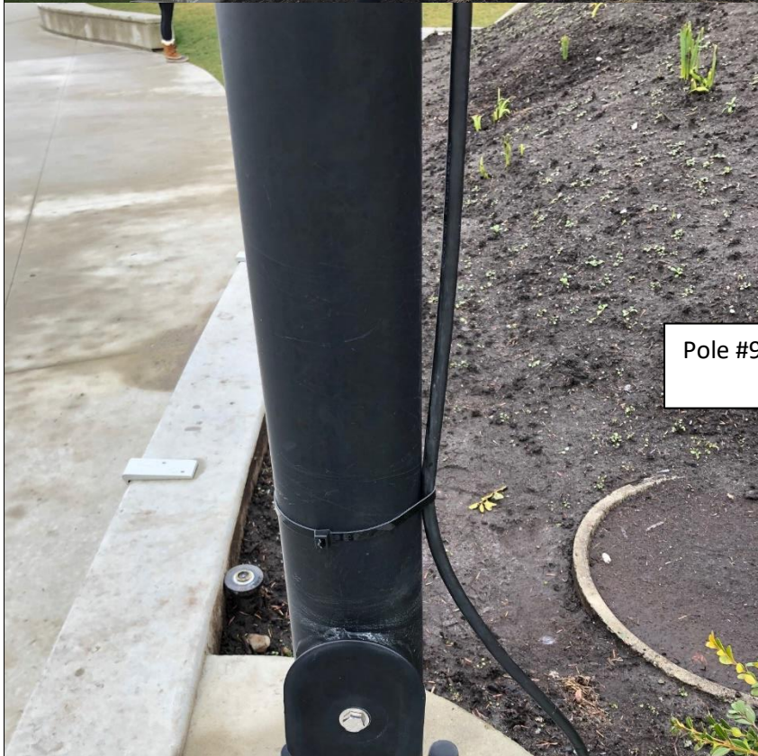
Pole #9: Scratches on the pole