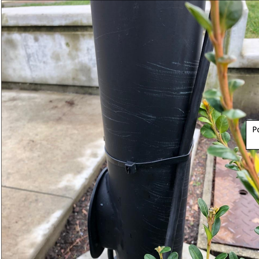
Pole #2: Scratches on the pole