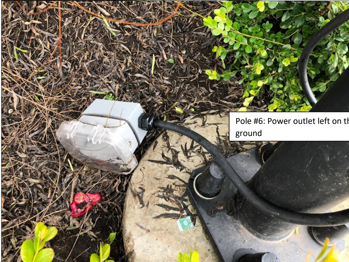
Pole #6: Power outlet left on the ground