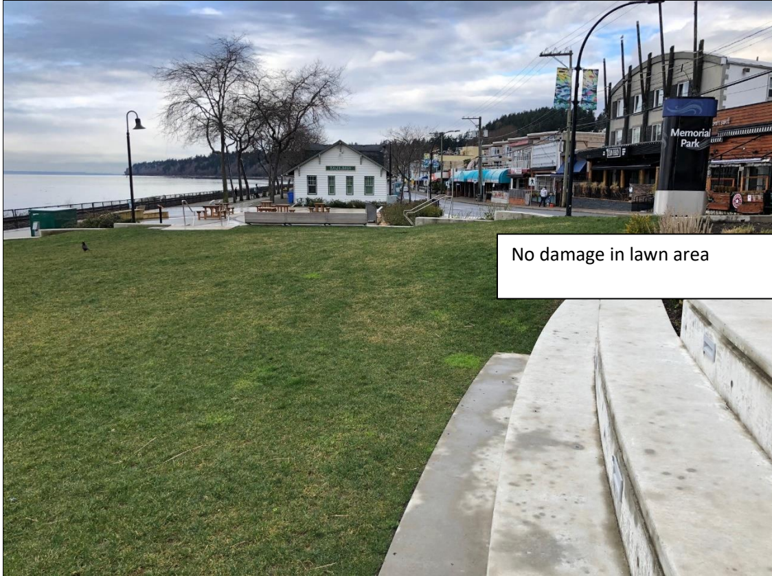
No damage in lawn area