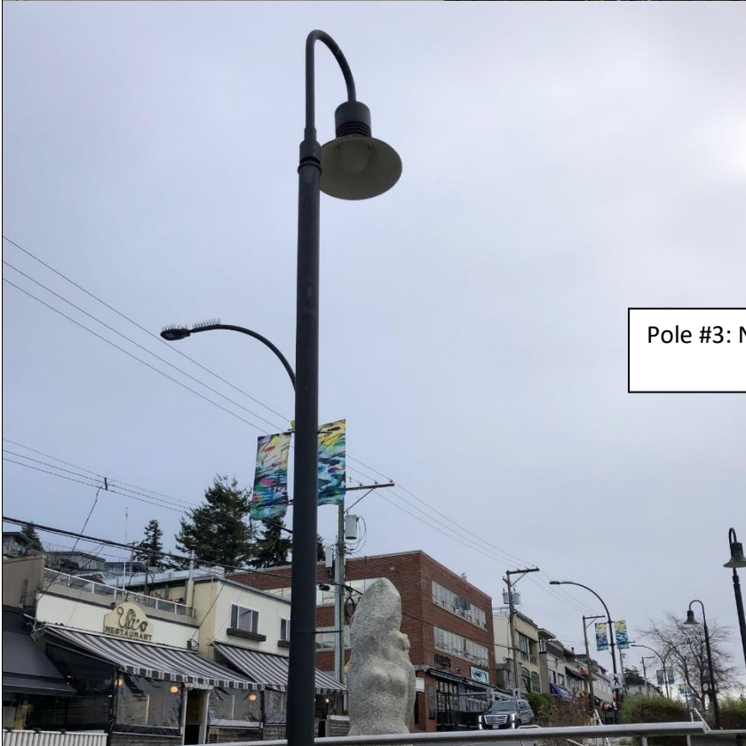
Pole #3: No damage on the pole