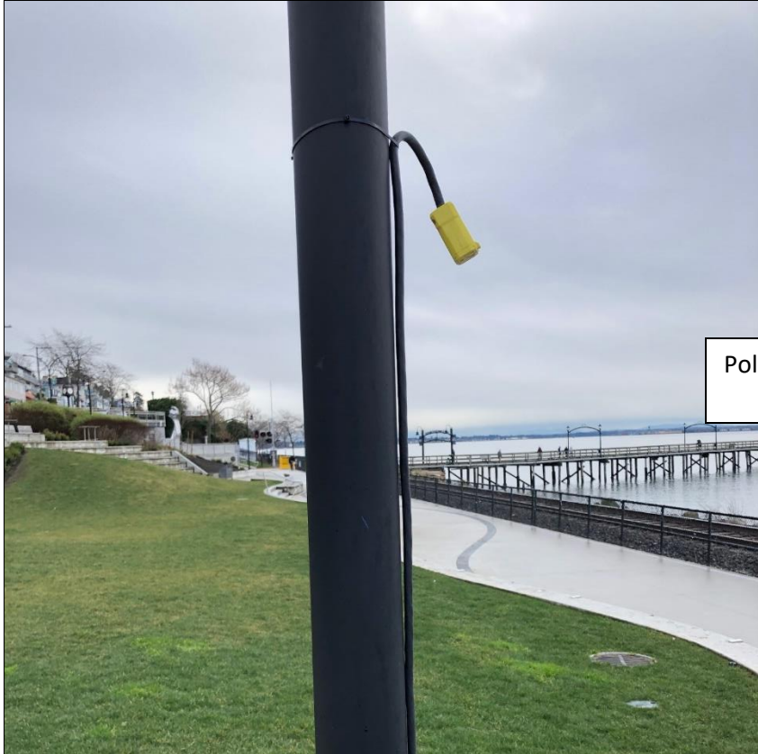
Pole #2: Scratches on the pole