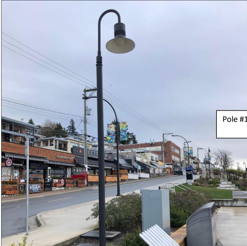
Pole #1: Scratches on the pole