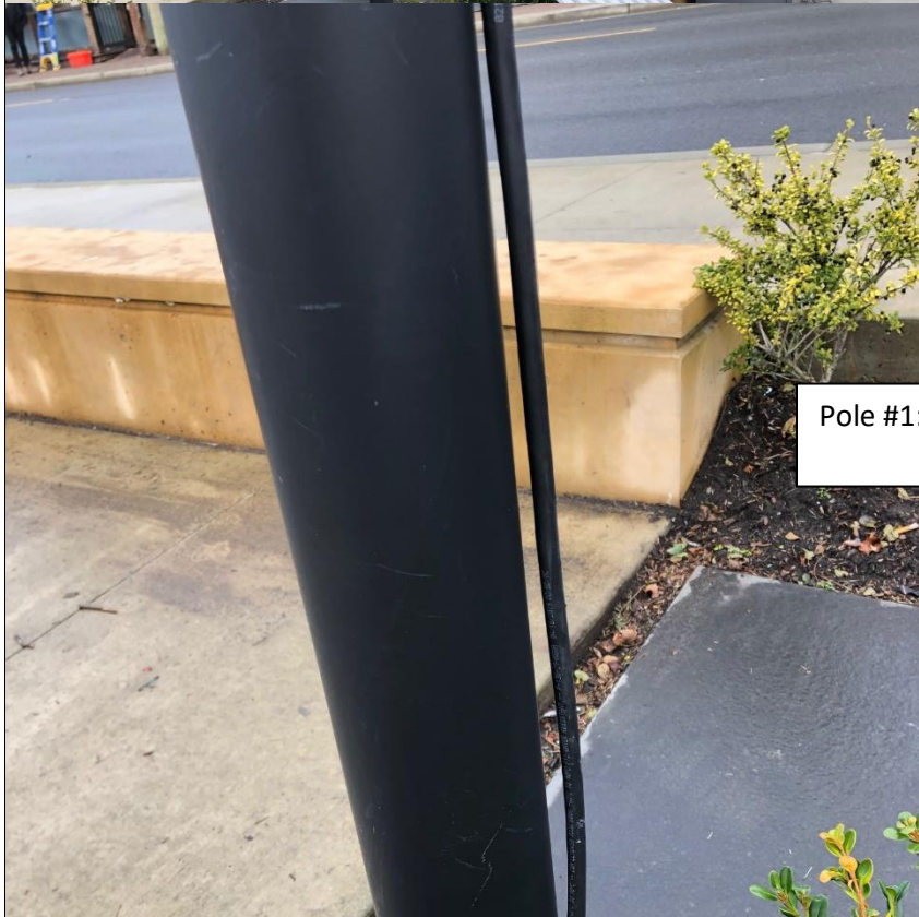
Pole #1: Scratches on the pole