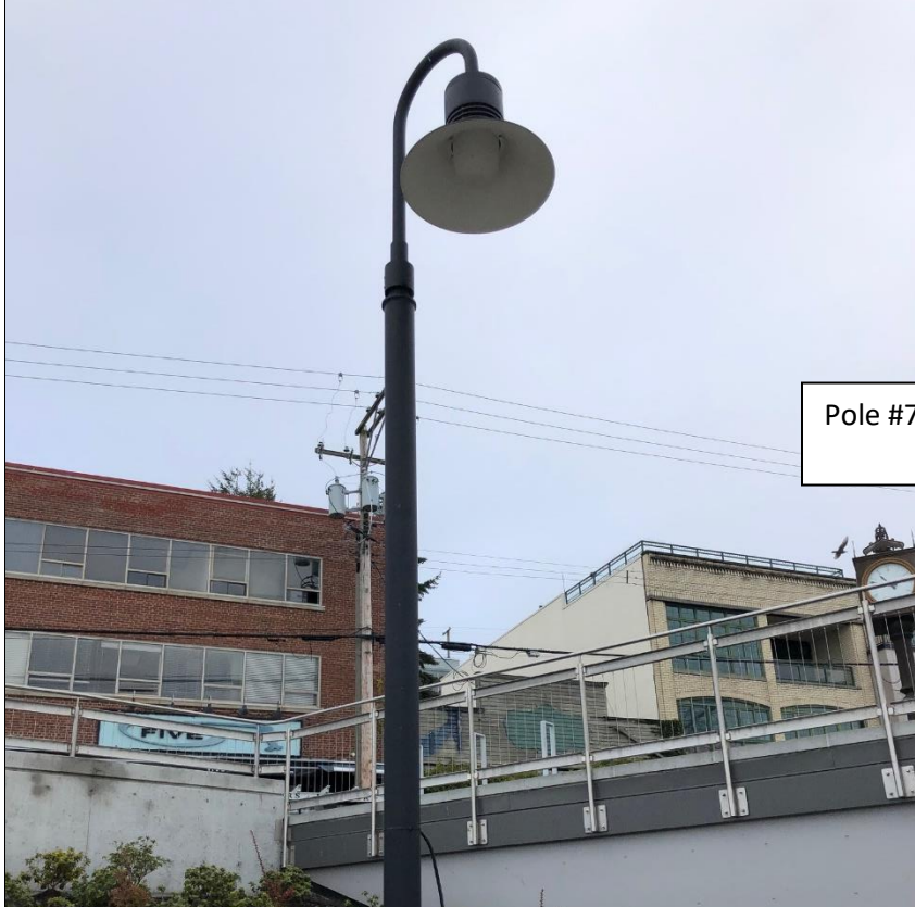
Pole #7: No damages on the pole