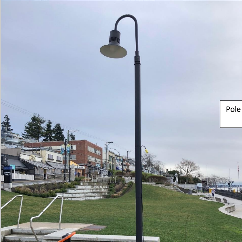
Pole #2: Scratches on the pole