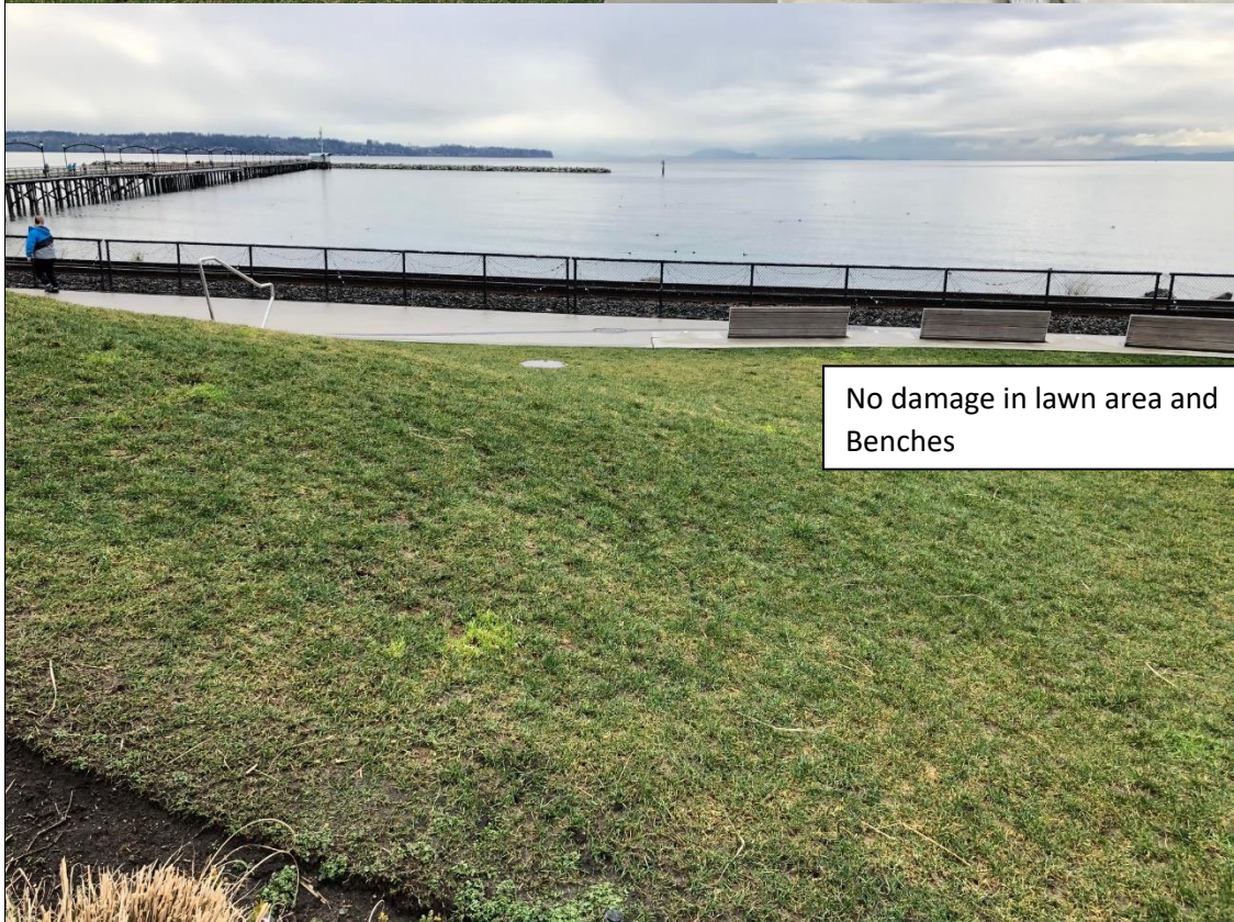
No damage in lawn area and Benches