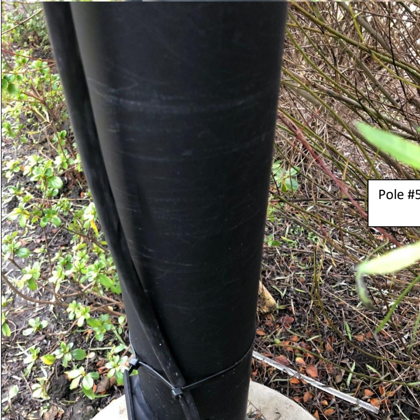
Pole #5: Scratches on the pole