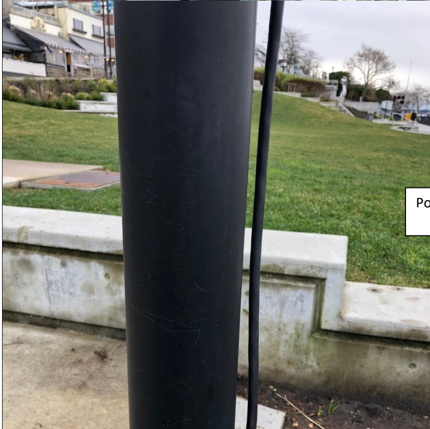
Pole #2: Scratches on the pole